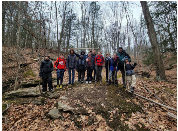
Guyasuta Camp Hiking and Fun, Feb. 7-9