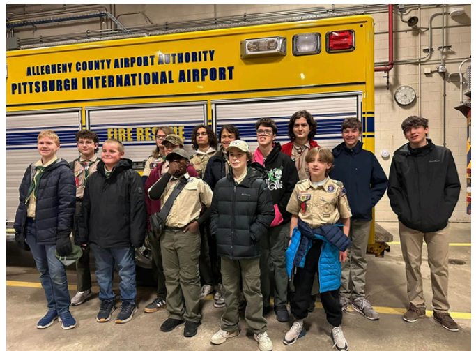
Allegheny Co. Airport Fire Station Visit, Jan. 28th